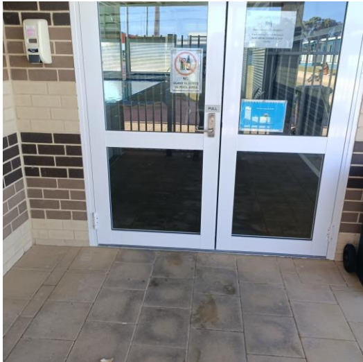
pool entry door Error! Bookmark not defined.