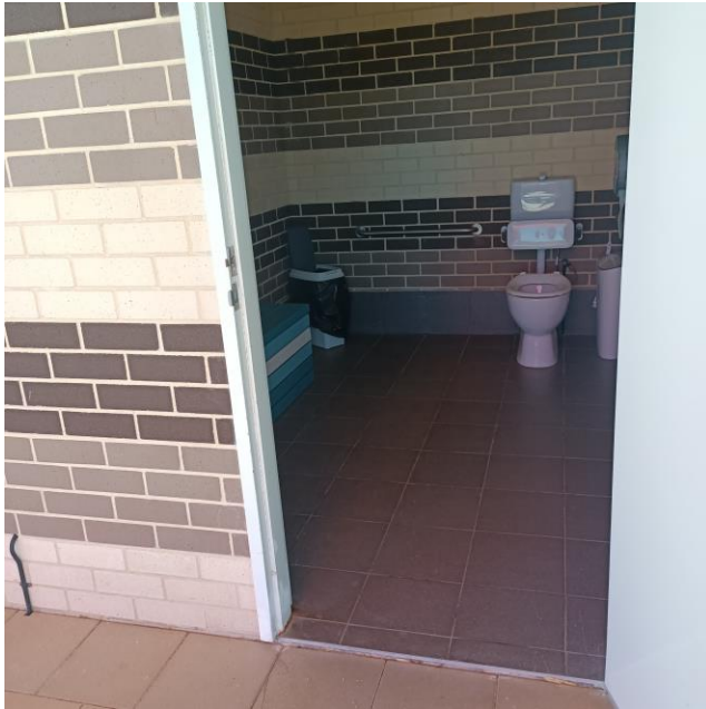
accessible toilets near pool Error! Bookmark not defined.