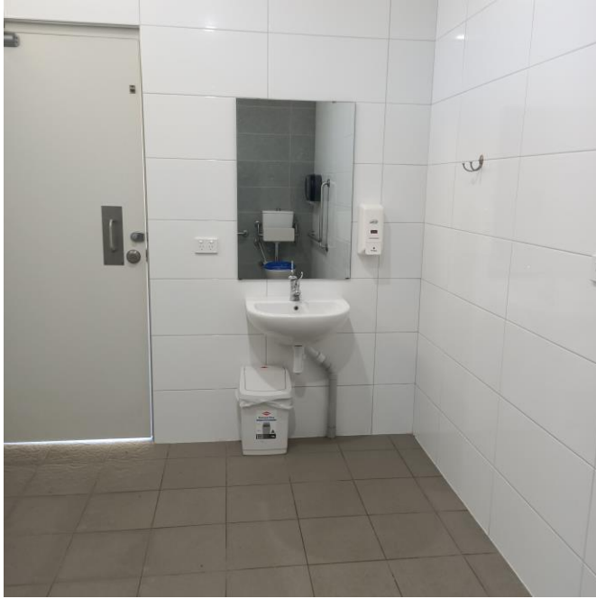
IMG20230630110952(1) Error! Bookmark not defined.