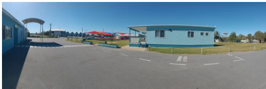
Screen Shot 2023-06-30 at 1.11.04 pm Error! Bookmark not defined.