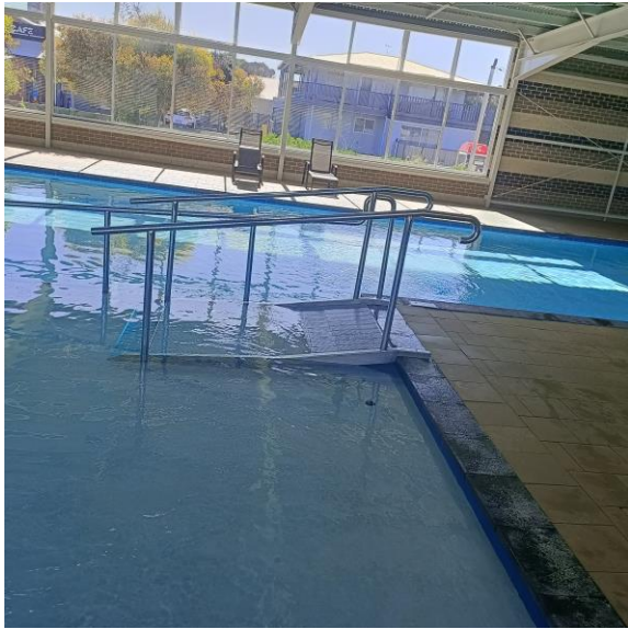
pool ramp Error! Bookmark not defined.