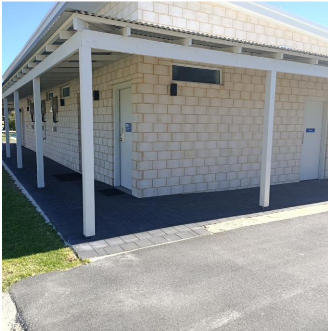
IMG20230630111207(1) Error! Bookmark not defined.