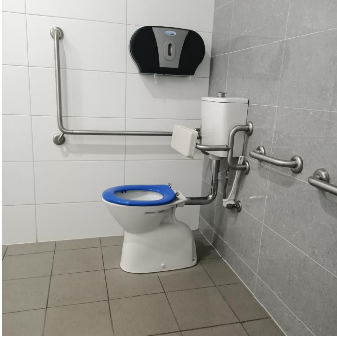
IMG20230630110931(1) Error! Bookmark not defined.