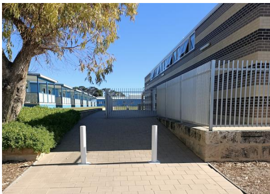
pool foot paths Error! Bookmark not defined.