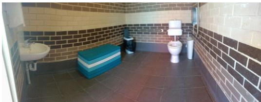
Pool Change Room Error! Bookmark not defined.